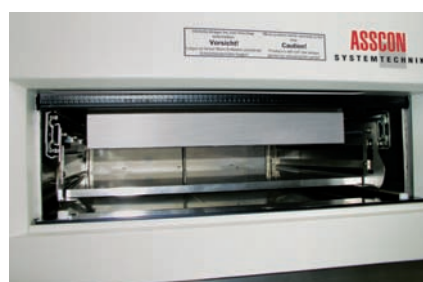
Unload lock with evacuation unit

The negative pressure removes voids and entrapments from the solder which is still in liquid state. The vacuum module is ventilated and opened again. Subsequently the assembly gets cooled and can be removed through the unload lock.