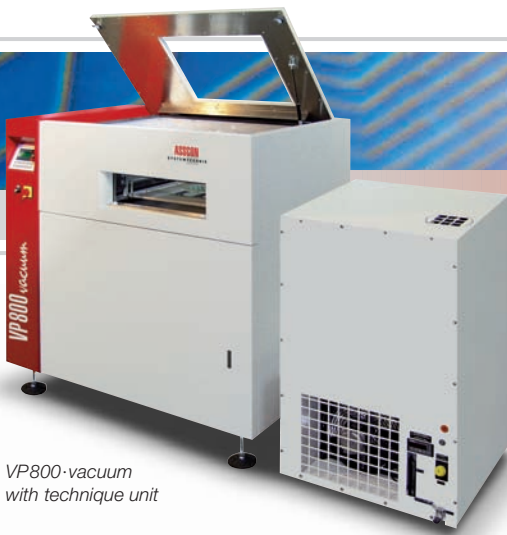
VP800-vacuum with technique unit