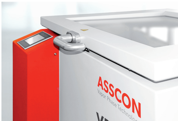
Top Loader Concept

The energy distribution across the whole assembly is homogeneous. Therefore three-dimensional assemblies may be processed without any problem.